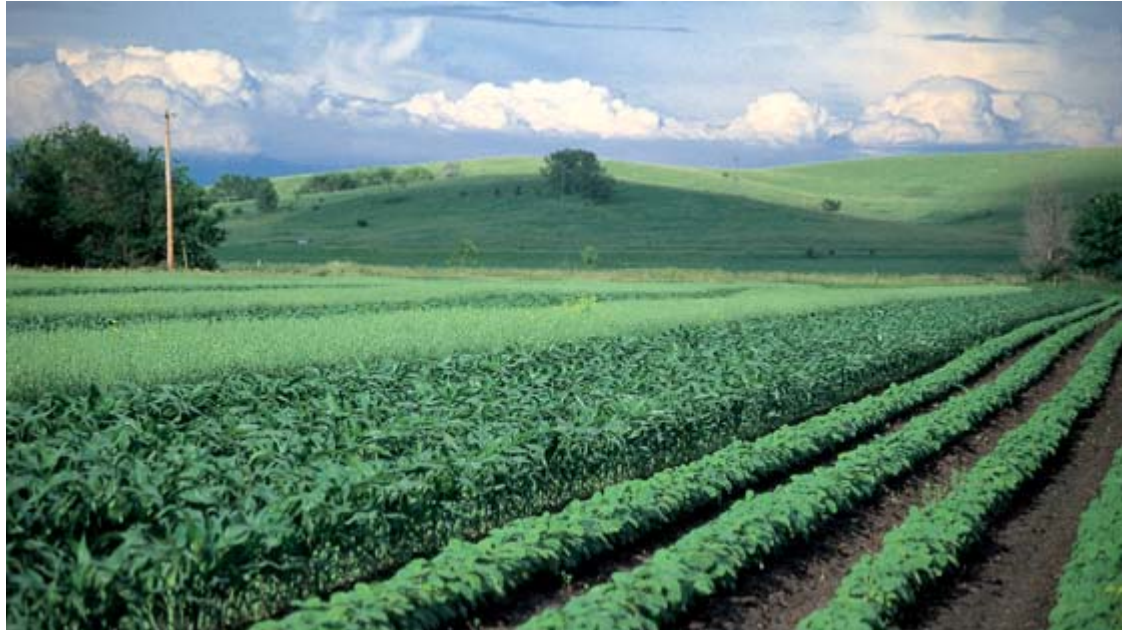
Growing an array of crops remains one of the hallmarks of successful organic farming. Diverse rotations improve soil fertility, break up pest cycles and provide many marketing options.